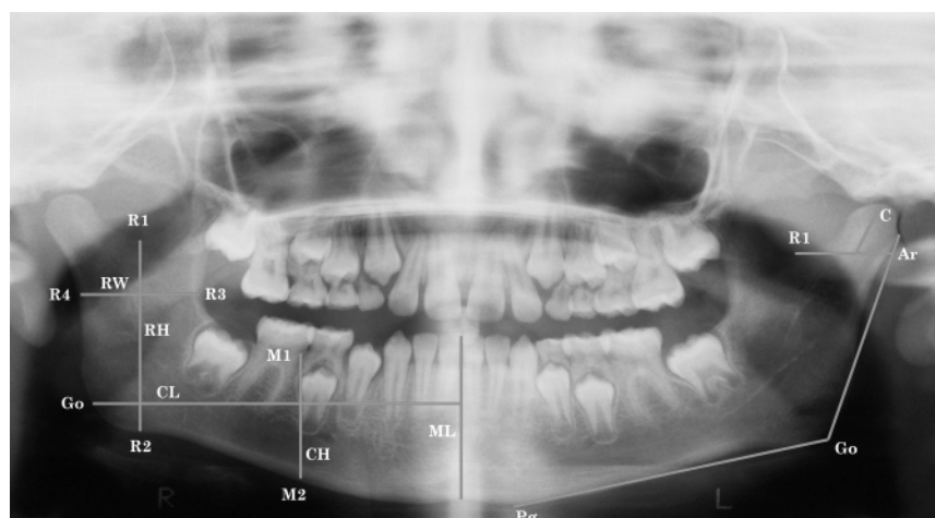
Figure 1 Panoramic radiograph showing the landmark points and linear and angular measurements used in this study. (R1–R4) Points described by Ricketts (1961) at the mandibular ramus: Go, gonion; M1, point at the cervical point of the first permanent molar; M2, corresponding perpendicular point to M1 at the inferior border of the mandible; Pg, pogonion; Ar, articular; C, condylion; RW, ramus width; RH, ramus height; CL, corpus length; CH, corpus height; ML, midline.

Corpus height (CH): perpendicular distance between the lowest mesial point of the permanent first lower molar at